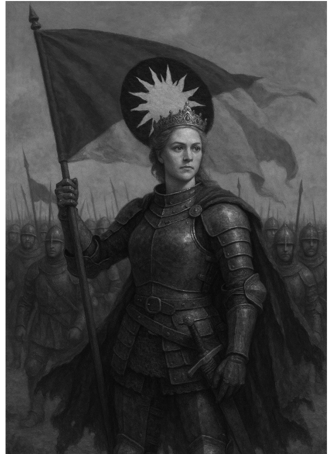
Image of Empress Arabella Hiram

But even more abhorrent are the whispers that Atticus Hiram—this so-called “King”—has reached out to ELVES for support. Yes, elves. Those same godless creatures whose lands we bled to defend against, whose treachery has cost us countless lives, and whose very existence threatens the moral fabric of our human dominion. (Cont. Page 2)