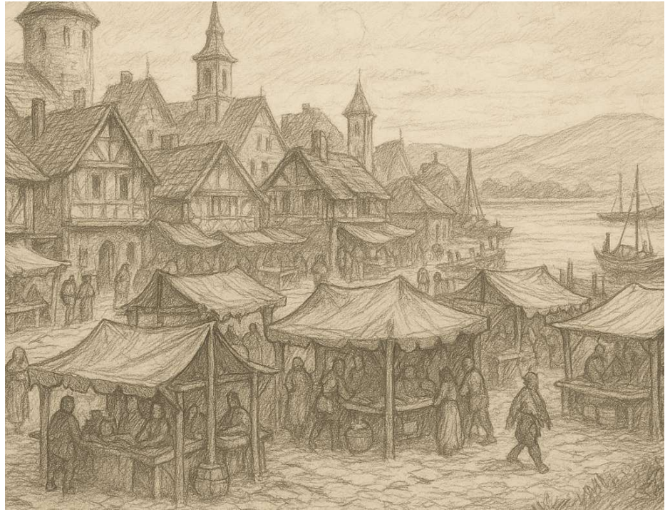
Brambleweave Market – City of Shau, Republic of Gult

The Council of Safety remains tight-lipped. Local clergy are performing warding rites daily, and children have been forbidden from leaving home after dusk. Whatever forces clashed that night, they were not of the common world—and they may return.